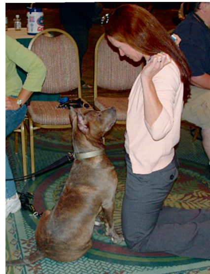
Teaching "sit" and "look" to a dog in laboratory class. Notice that the human moved closer and lower (by kneeling) to this dog to keep the dog focused on her. The dog is about to be given a treat which is enclosed in the human's left hand (a clicker is in the right hand).

"Bonnie—sit—(3-second pause)—sit—(3-second pause)—Bonnie, sit, look—(move closer to dog and move treat to your eye to encourage her to track the treat to your eye and "look")—sit—good girl! (treat)—stay—good girl—stay (take a step backward while saying "stay"—then stop)—stay Bonnie—good girl—stay (return while saying "stay"—then stop)—stay Bonnie—good girl (treat)—okay (the releaser and she can get up)!"